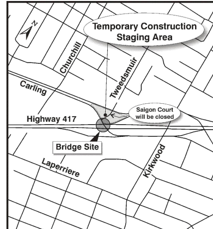
MAP B TEMPORARY CONSTRUCTION STAGING AREA

This project has been divided into several separate contracts. Contracts No. 1 and No. 2 included the deck replacements of the Island Park Drive and the Clyde Avenue bridges using rapid replacement technology and were completed in 2007 and 2008 respectively. Contract 3 is the focus of this notice and includes the deck replacement of the Carling Avenue eastbound bridges using rapid replacement technology. Subsequent contracts will involve replacing the Carling Avenue westbound and Kirkwood Avenue bridge decks using rapid replacement technology, and rehabilitating the Merivale Road bridges.